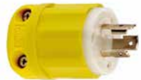
20 Amp 125-Volt NEMA L5-20P 2-Pole 3-Watt Locking Plug

Connect L5-20P electrical connector to service panel using suitable wire gauge for the wire length (minimum 12-gauge). Alternatively, use a suitable adapter to connect to the L5-20P twist lock inlet. All connections must be correctly grounded and have current limit protection at 20-amps.